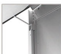
Iron hook support rod for panel support