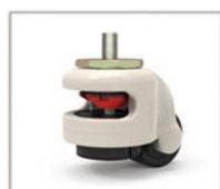
Footmaster Caster Universal caster with brake and leveling feet.