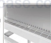
Anti-paper dust structure