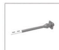
Wind Speed Sensor & EC Fan