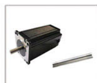
Stepper Motor and Handle The front window can be controlled manually or electrically