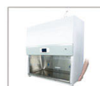
Cabinet Support Block Easy to lift, prevent hand pressing