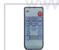
Remote Control All functions can be realized with it, making the operation much easier and more convenient.