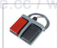
Foot Switch Adjust front window height by foot during experiment, to avoid airflow turbulence caused by arm movement.